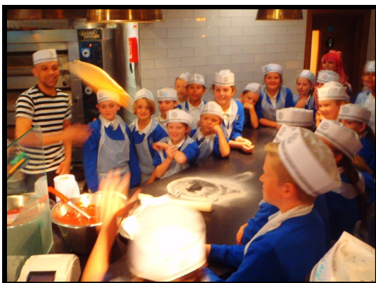
Left: Leopard class learning authentic techniques to ensure their dough rises.