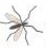
crane fly (daddy-long-legs)