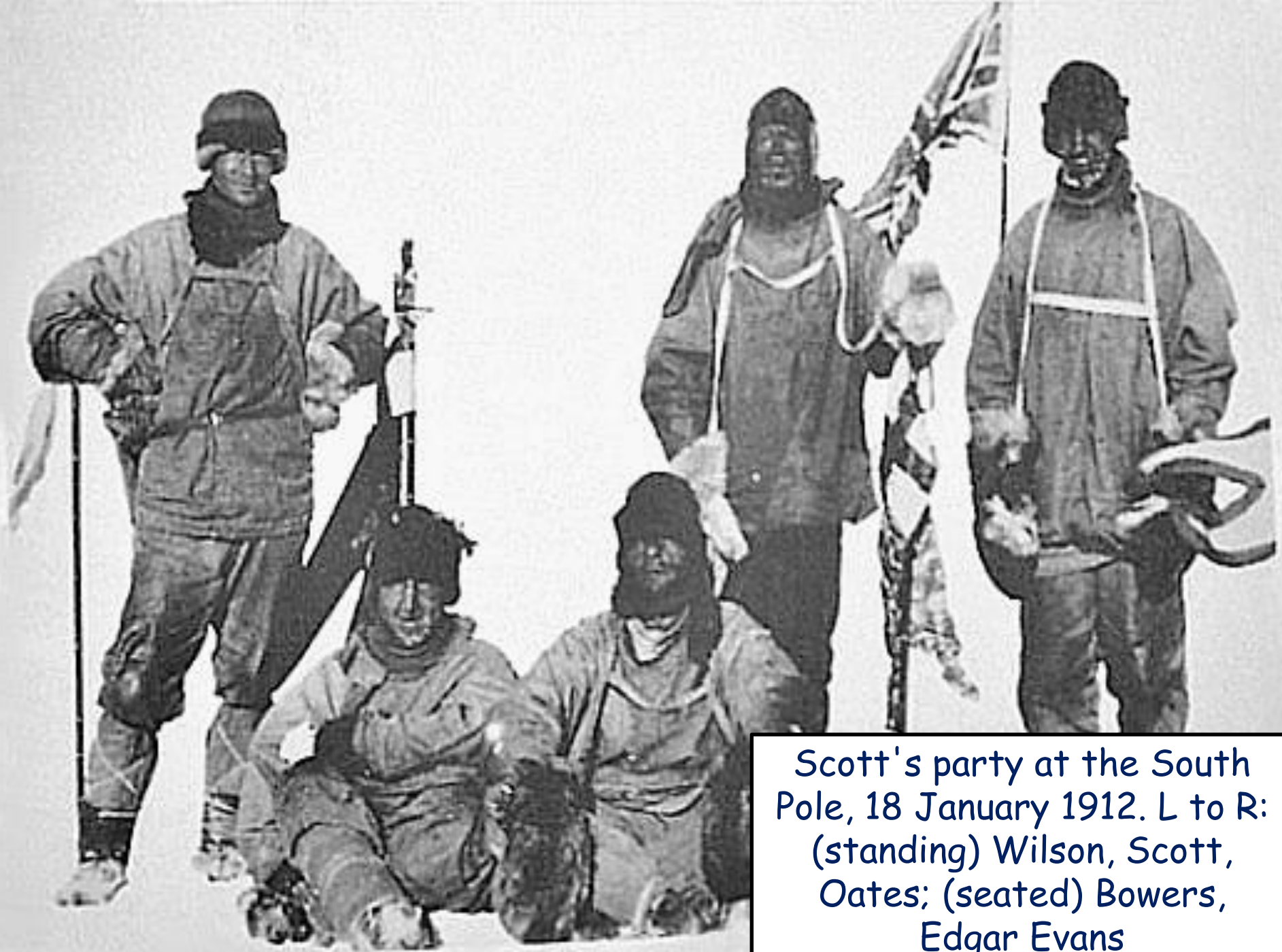
Scott's party at the South Pole, 18 January 1912. L to R: (standing) Wilson, Scott, Oates; (seated) Bowers, Edgar Evans