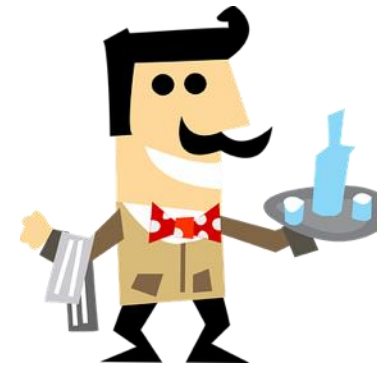
w a i t e r