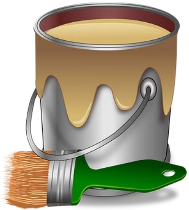
p a i n t

What can you see? Write down what these images are: