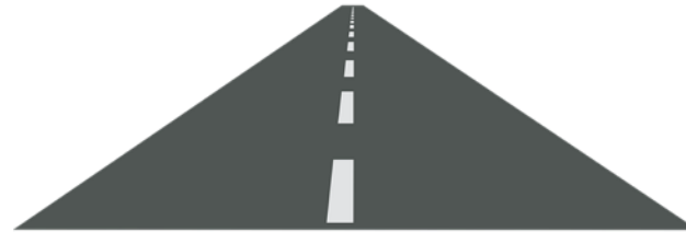
st r a i g h t