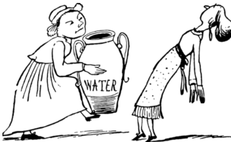
f a i n t