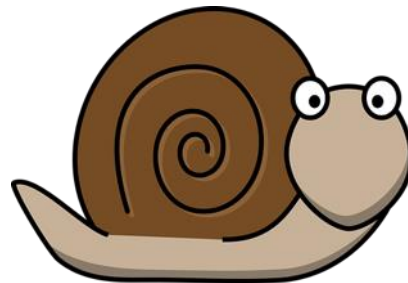
s n a i l