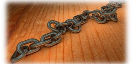
ch a i n